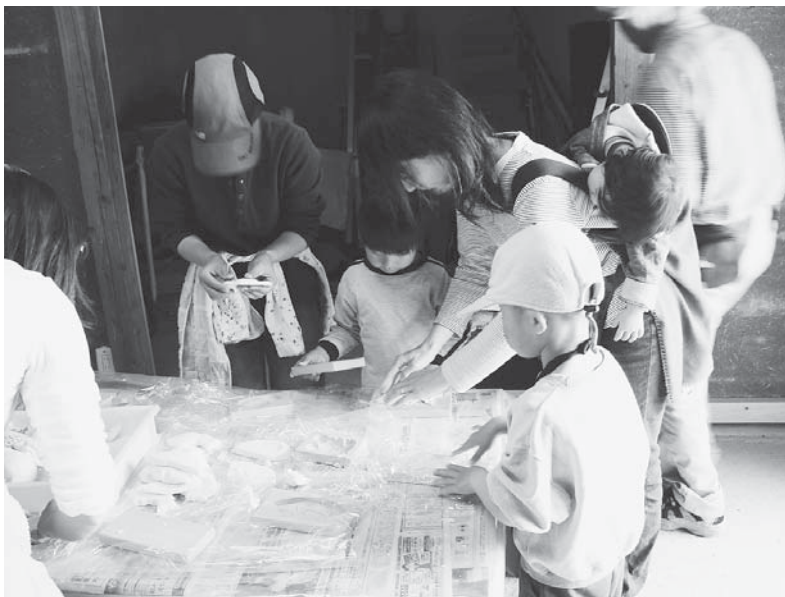
Fig. 2. Traditional events will be transmitted to next generation.