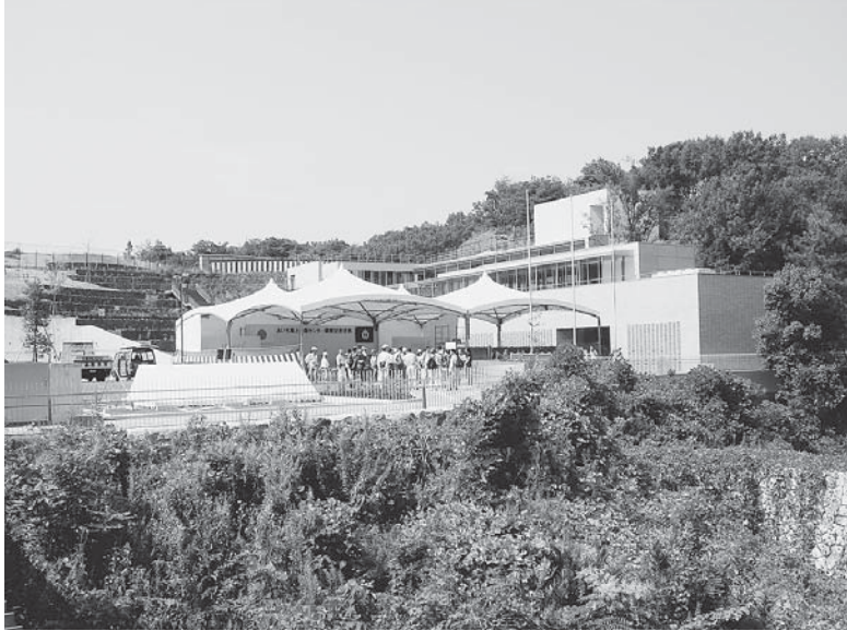
Fig. 3. Kaisho-no-mori learning center for sustainability. This building was constructed as Aichi prefectural pavilion in Expo Aichi 2005.