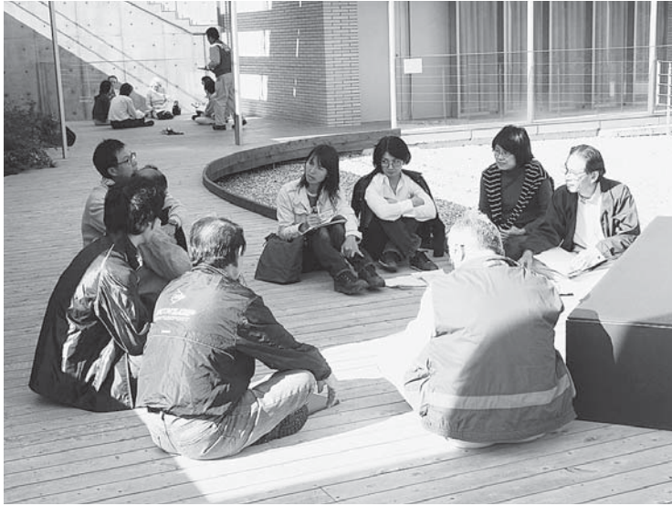
Fig. 5. Discussion between citizens and local government at learning center.