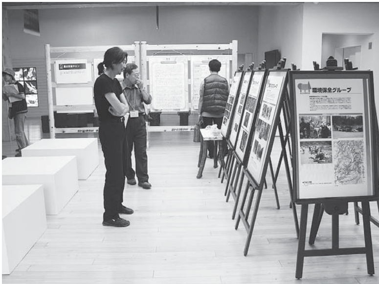
Fig. 4. Educational display by citizens' group at Kaisho learning center.

issues. As of today, more 50 thousands visitants came and studied the states and needs of conservation of Kaisho forest and local traditional life. The other hands, this center promotes educational program “Kaisho-no-mori learning center for sustainability” since 2007, with citizens and academic supporters. This program has some educational courses (forestry, conservation, citizens' activities, etc.) and is