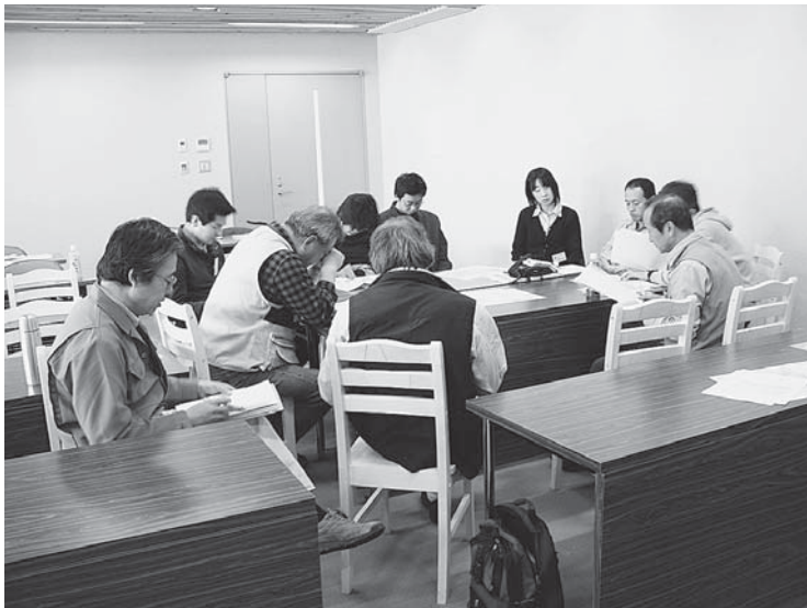
Fig. 6. They discussed the way of conservation and co-existence between human and nature.

available for all citizens in Japan and foreigners (international course). This program will be continued 10 years.