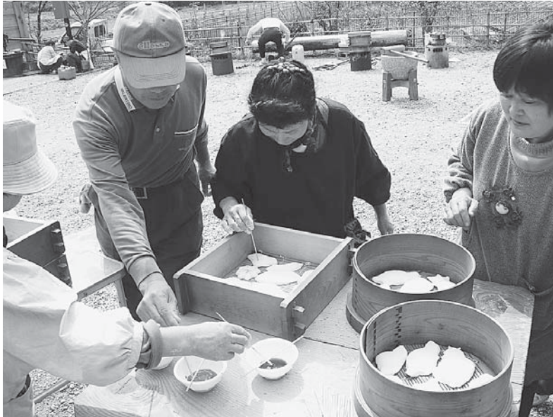
Fig. 1. Activity by citizens for preservation of traditional life and events